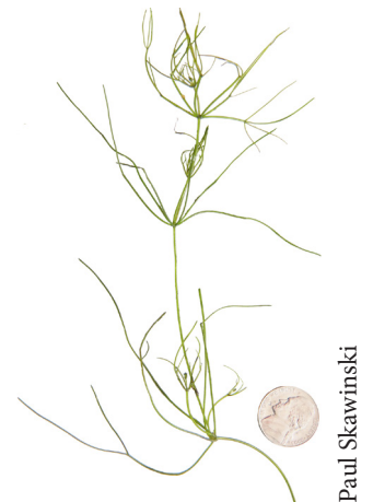
Starry stonewort is a type of algae that resembles a vascular plant